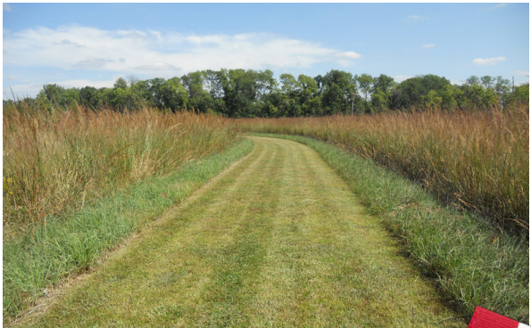
The Heritage Trail begins on the south side of Litzenberg Memorial Woods.