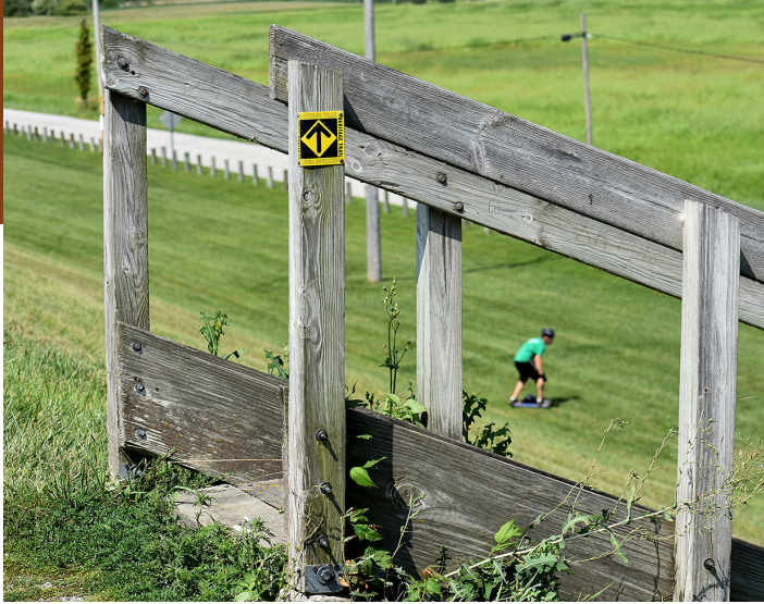
Yellow trail markers with black directional arrows lead the way along the Heritage Trail.

On December 1, 1984, Jeannie Wiley, staff writer for The (Findlay) Courier , wrote, "Despite the traffic that rushes by on U.S. 224, Indian Green Cemetery stands today as it has for more than 100 years—a quiet, grassy clearing, protected from the world by willow trees and the Blanchard River." History tells us that the tombstones identify the final resting place for early pioneers and that before the pioneers, the land was used as an Indian village and burial grounds. Indian Green Cemetery is rich in history, and a fitting destination along the Heritage Trail.