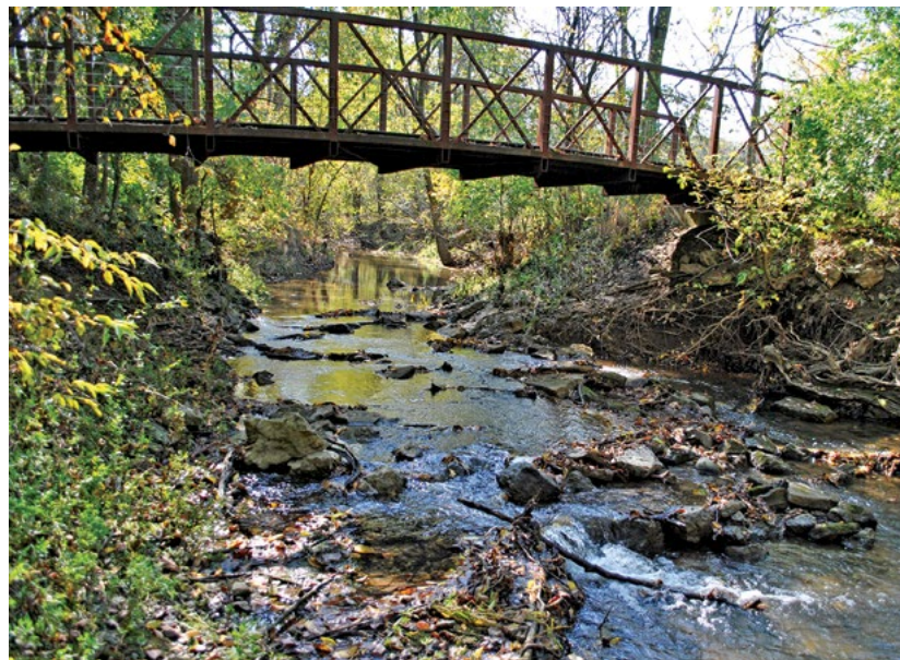
The footbridge at Aeraland Recreation Area affords a bird's-eye view of the scenic South Branch Portage River.