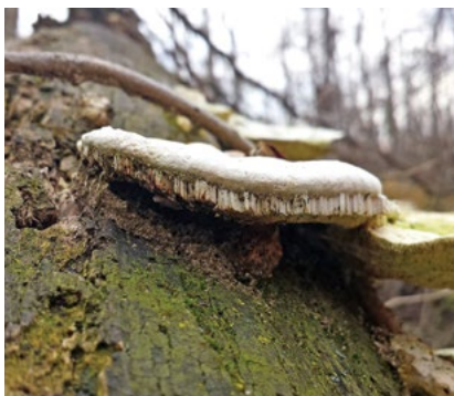
Blanchard River Nature Preserve is managed to preserve its flora, fauna, and natural features.

With a strong emphasis on environmental preservation, visitation is limited to hiking, birdwatching, and landscape and wildlife photography along a quiet walkway to the river's edge, and boating and fishing via a primitive river access site.