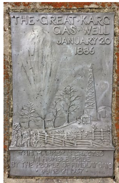
Monument honoring the Great Karg Well

As a quiet wayside destination, the park provides access to the Blanchard River for fishing. From the canoeist and kayaker perspective, it serves as a portage that gives paddlers an opportunity to rest before continuing downstream.