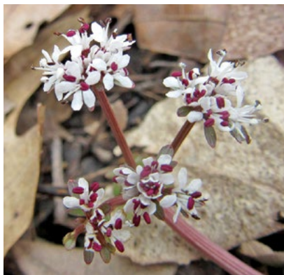
Aeraland Recreation Area's Highline Trail offers the perfect hike for spotting wildflowers, including Erigeron bulbosa —commonly known as 'Harbinger-of-Spring' or 'Pepper and Salt'.

Aeraland Recreation Area's passive nature is balanced by the Arcadia Soccer Club's use of several acres for youth soccer.