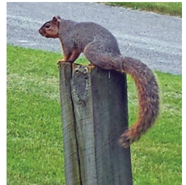
Visitors to River Landings can enjoy wildlife sightings under the trees.

River Landings (10 acres) serves as a wayside destination for rest and relaxation and presents opportunities for play and picnicking. It also serves as the western terminus for the Blanchard River Greenway Trail.