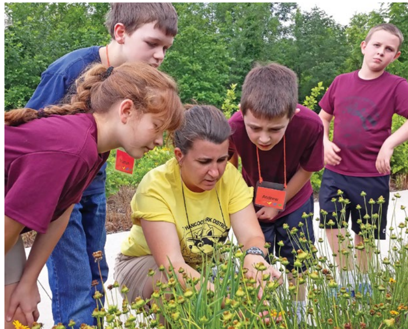
The Richard S. “Doc” Phillips Discovery Center at Oakwoods Nature Preserve is active all year-round, with indoor and outdoor programs like this summer camp for young naturalists.