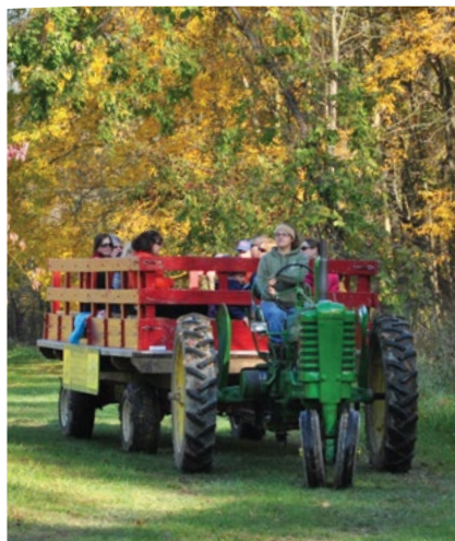
Riding in a tractor-drawn wagon through brilliant autumn colors is a unique way to experience Riverbend Recreation Area.

Up to 25 people at a time can enjoy an autumn adventure on the back of our wagon. Tractor-drawn hayrides are available mid-September to early November, weather permitting, and are scheduled on a first come, first served basis with a $60 advance registration and payment.