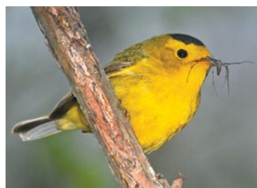
The Discovery Center's wildlife viewing area is a birdwatching destination.