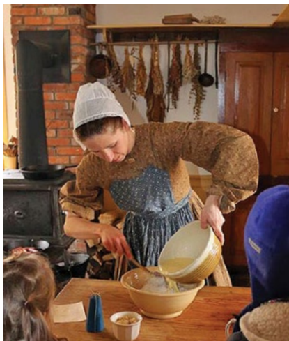
Visitors to the McKinnis House at Litzenberg Memorial Woods can witness living history c. 1847, from woodstove cooking to the herb garden.