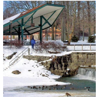
The Waterfalls Pavilion and Riverside Park Waterfront are a scenic view across from the Waterfalls Area.

Visitors may walk along the Blanchard River Greenway Trail, picnic, launch, land, and portage canoes and kayaks, and access the Blanchard River for fishing.