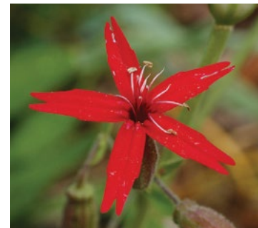
Fire pinks and other native blooms thrive along the Heritage Trail.

This section of Litzenberg Memorial Woods is located on the south side of U.S. Route 224 West. The area includes natural hiking and bridle trails in the midst of woods, wetlands, and prairie, and serves as the western terminus of the 20-mile Heritage Trail.