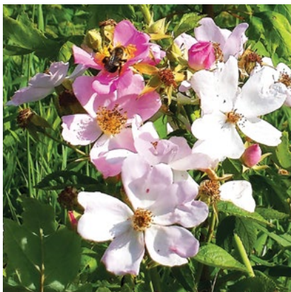
Hancock Park District's conservation areas are home to prairie roses and other native pollinator plants.

Collectively, 29.4-acre Bright Conservation Area at 10184 Township Road 244, 7.1-acre Lehman Conservation Area at 16428 Township Road 208, and 54.2-acre Riverbend Conservation Area west of the intersection between Township Road 207 and Township Road 244 along with Riverbend Recreation Area form an impressive 220-acre outdoor complex along the banks of the Blanchard River.