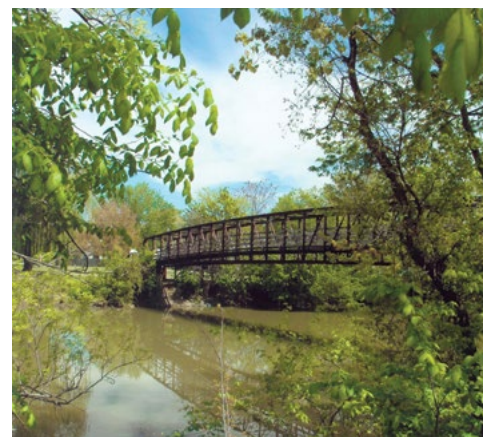
A scenic pedestrian bridge crosses the Blanchard River at Civitan Park.

Civitan Park serves as a 3-acre neighborhood park with community-wide access to active play facilities, including playground, basketball court, multi-use trail, and an open play area.