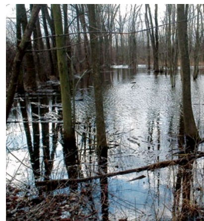
The vernal pools at Blue Rock Nature Preserve are an important spawning ground for amphibians.

The 11.3-acre Blue Rock Nature Preserve is now a showcase of natural succession serving as a neighborhood park and oasis and offering an escape from the hustle and bustle of life. Visitors enjoy the small wetland and woods and their inhabitants, hiking and birdwatching along the .3-mile Lady Bug Loop Trail, and perhaps a bench and a book.