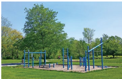
The fitness center at Centennial Park is perfect for exercise in fresh, open air.

The 5-acre Centennial Park, while limited in its offering, integrates an outdoor fitness center with the adjacent Blanchard River Greenway Trail to create a complete exercise program.