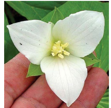
Trilliums and other native Ohio plants line the walkway at the HPD Administrative Office.

Information about programs, parks, and services is available inside during business hours and on display 24/7 at the outdoor visitor center. The tranquil setting is ideal for nature lovers and outdoor enthusiasts.